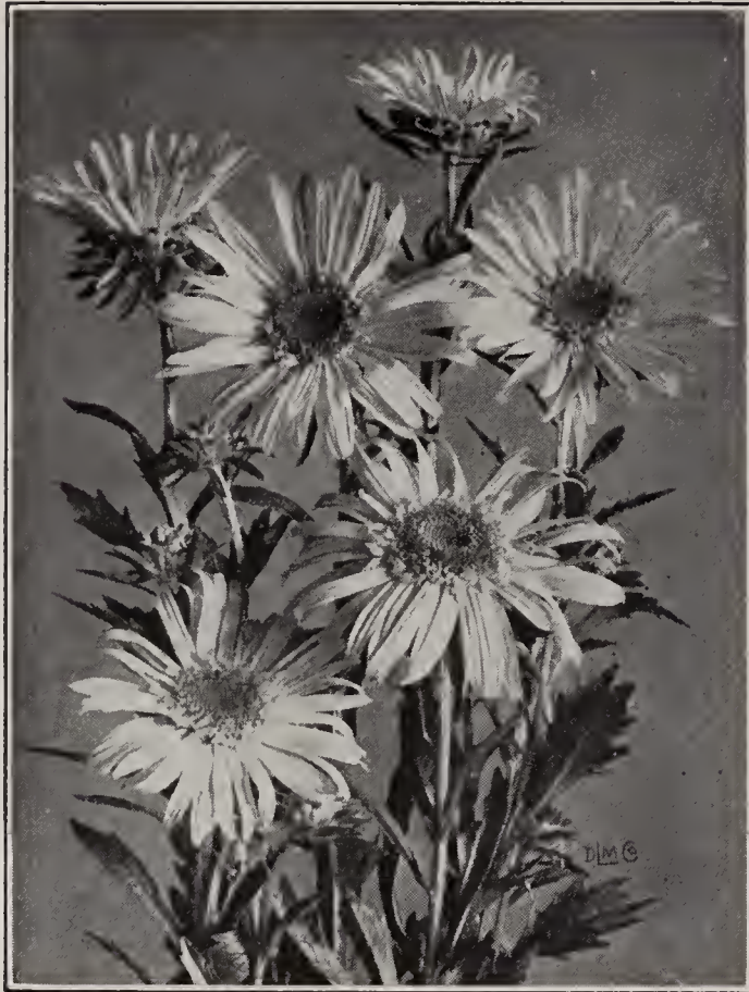
HARDY ASTER, QUEEN MARY